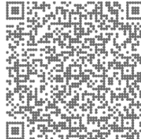
Text to Give