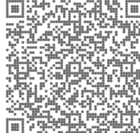
Text to Give