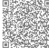
Text to Give