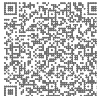
Text to Give